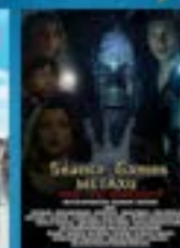
Séance Games -...