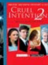
Cruel Intentions 2

Awards: 54 wins, 21 nominations & 1 additional award